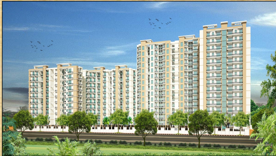
PROPOSED PROSPECTIVE VIEW