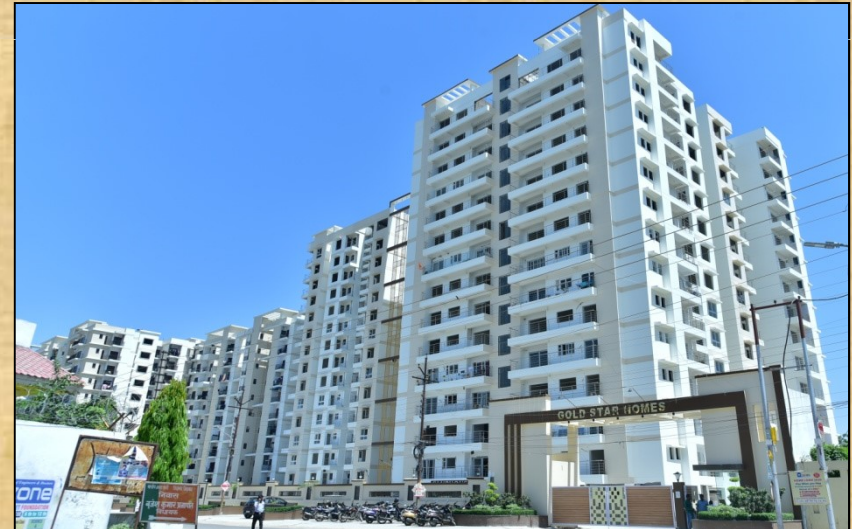
ACTUAL PICTURE MARCH -2021